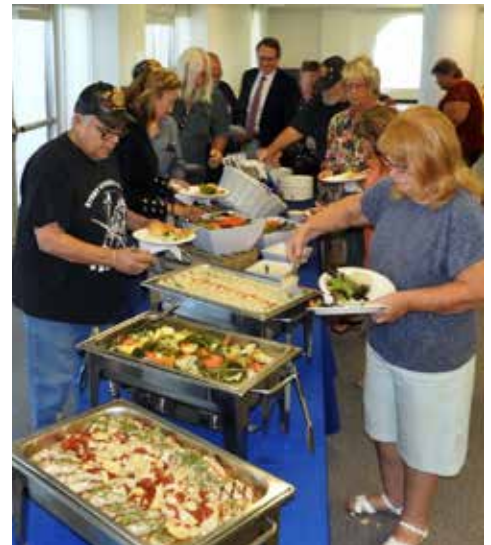
Attendees line up at the chow line.