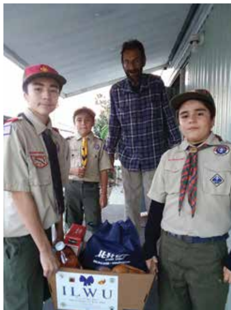
Boy Scouts from Troop 104 assisted in the delivery of food to veterans.