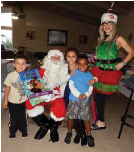
Santa and his helper take a moment to pose with happy kids.