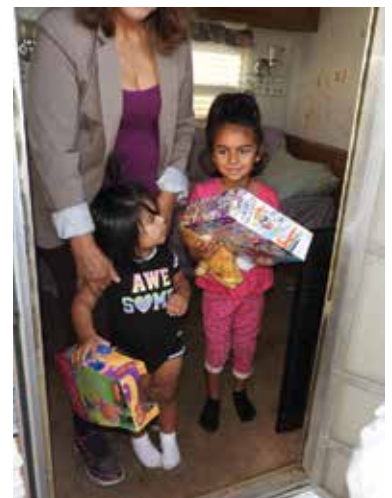
Children said thank you for the gifts presented by Santa and his helpers.