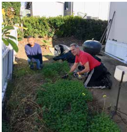
This is just one clear example of the hard work performed by Cottonwood Church Outreach Program volunteers removing weeds from one veterans yard, and the final result of their hard labor.

Under the aegis of VAHP VeteransAffordableHousing.org (888) 923-VETS (8387)