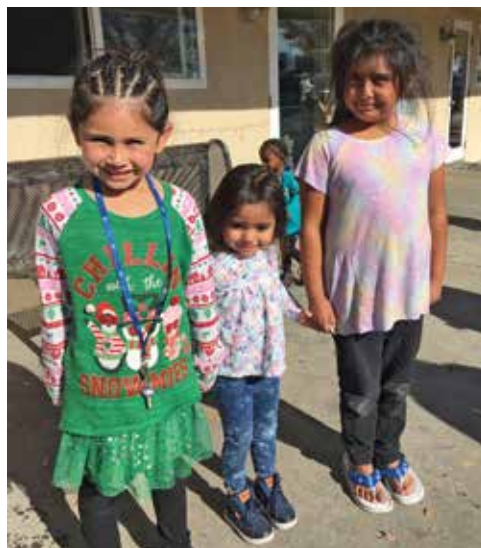
These youngsters get ready to celebrate at the AVAG Christmas party.