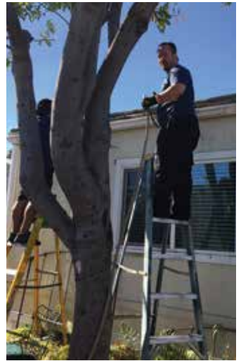
Cottonwood Church Outreach volunteer cleans a veteran's gutters preparing for winter storms.