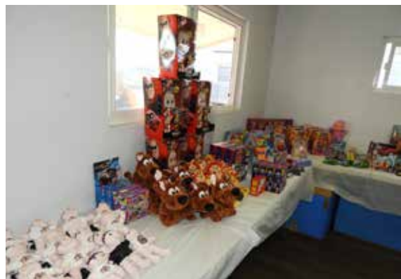
Some of the gifts presented to children at the Christmas party donated by UMNPA.