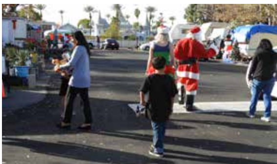
Santa and volunteers move out to give presents to children/families unable to attend the event at the club house.