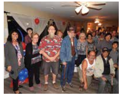
Part of the group in attendance for the meeting, which included community members who joined our veterans for the night's activities.