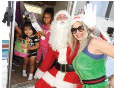
This photo captures the happiness of the Christmas spirit at the Christmas party.