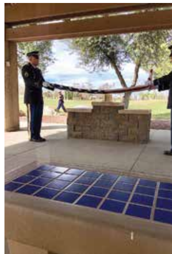
Army honor guards fold ceremonial American flag during service.