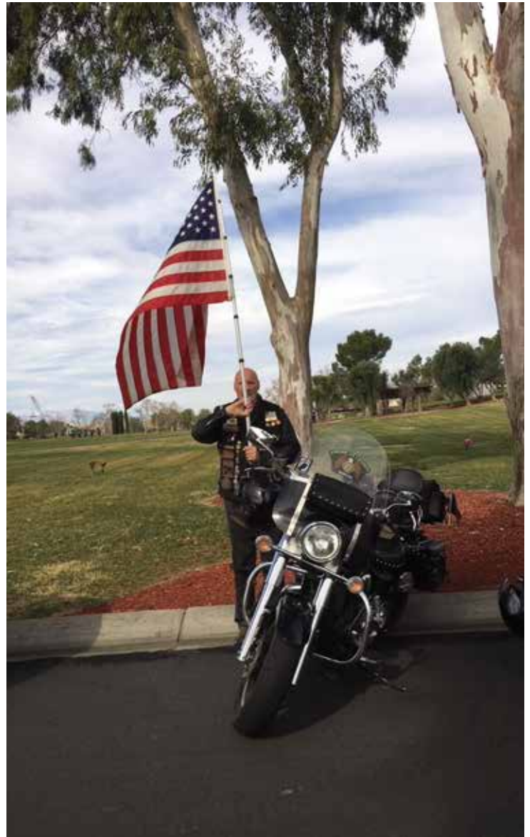
A Patriot Guard Rider stands at attention with our flag at Brewer's burial.