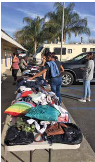
Following a recent Bible study group meeting in Hemet, AVAG volunteers held a free clothing, and purses event for veterans and park residents.