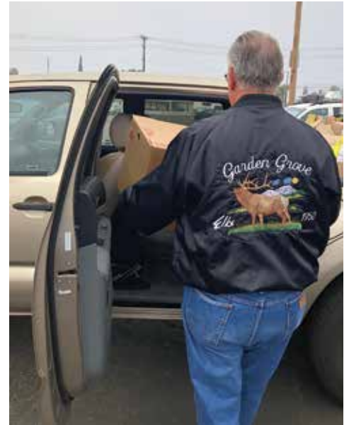
Garden Grove Elks Lodge Post 1952 members load food that was distributed to veterans and families a few days before Christmas.