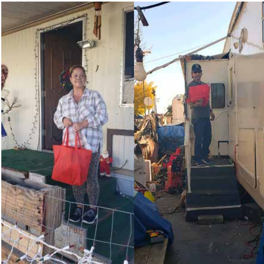
The third phase of the operation brought blessing bags to Hemet Valley veterans and family members.