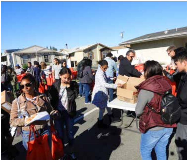
Cottonwood volunteers move out into Creekside community to pass out Love To Others bags that were filled with food, supplies and gifts.