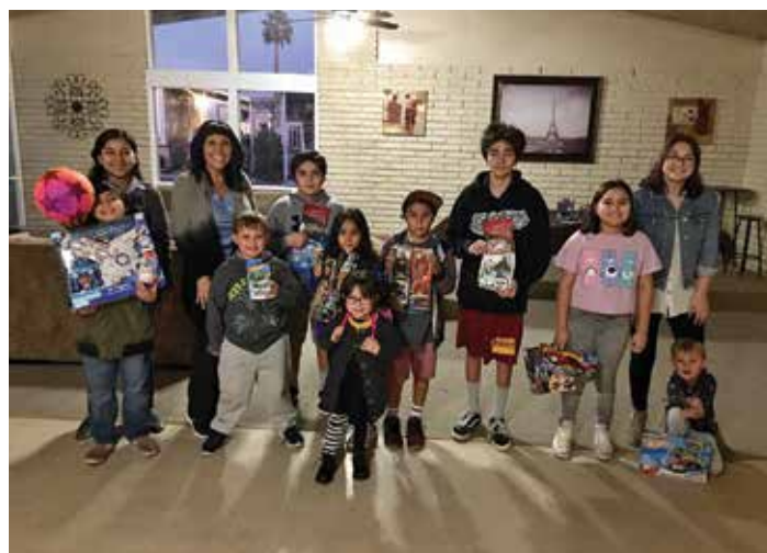
The AVAG Bible study kicked off the new year at the Santiago Creekside Estates with pizza, prizes and scripture.