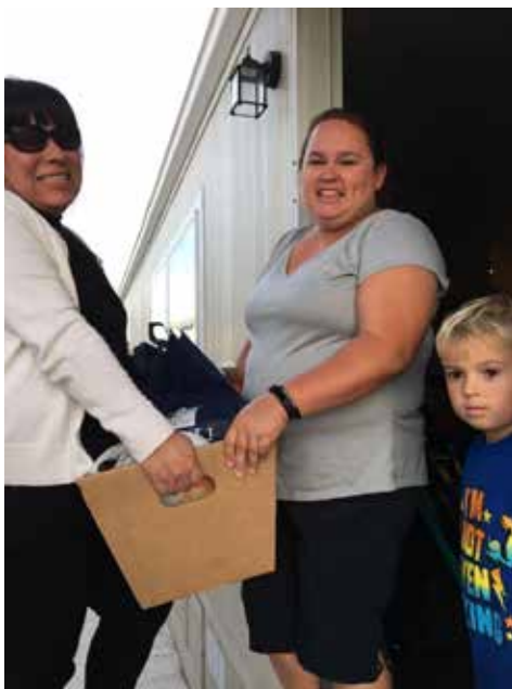
An AVAG volunteer delivers a box of goodies to a happy resident.