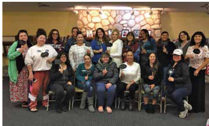
The Unleash Your Purpose Women's Ministry recently met at the Santiago Desert View Estates in Barstow as part of the AVAG Bible study groups that have grown over the last year. This is the post-meeting photo opportunity.