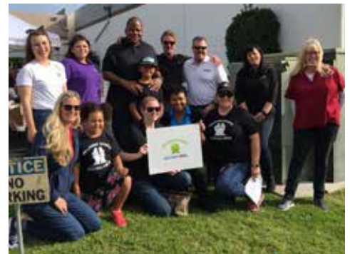
Helping Hands Giving Hope volunteers on turkey day.

As is often the case with AVAG community projects, there were several critical organizations that helped to collect the food, sort it, pack it and deliver it to veterans in four communities Creekside, Creek Orange Estates, Santiago Desert View Estates in Barstow and Hemet. In addition to Helping Hands Giving Hope, the ILWU and The Richard Breunig Foundation made significant donations both in food items but also with volunteers who spent hours working to give AVAG veterans an enjoyable Thanksgiving.