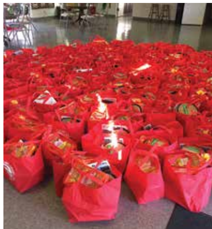
The Community Room is awash with red blessing bags that volunteers and AVAG filled before distributing them to veterans.