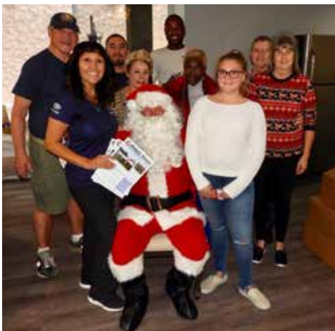
Some of the AVAG volunteers and veterans.

The weekend before Christmas AVAG volunteers and partners provided toy giveaways to in four AVAG parks.