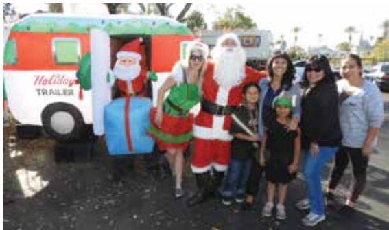
Santa and some of his helpers pose for a closing photo outside the Holiday Trailer.