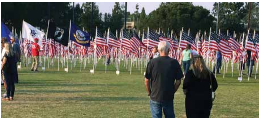
In the center of this flag display is the national POW/MIA flag which was designed by the National League of POW/MIA Families.