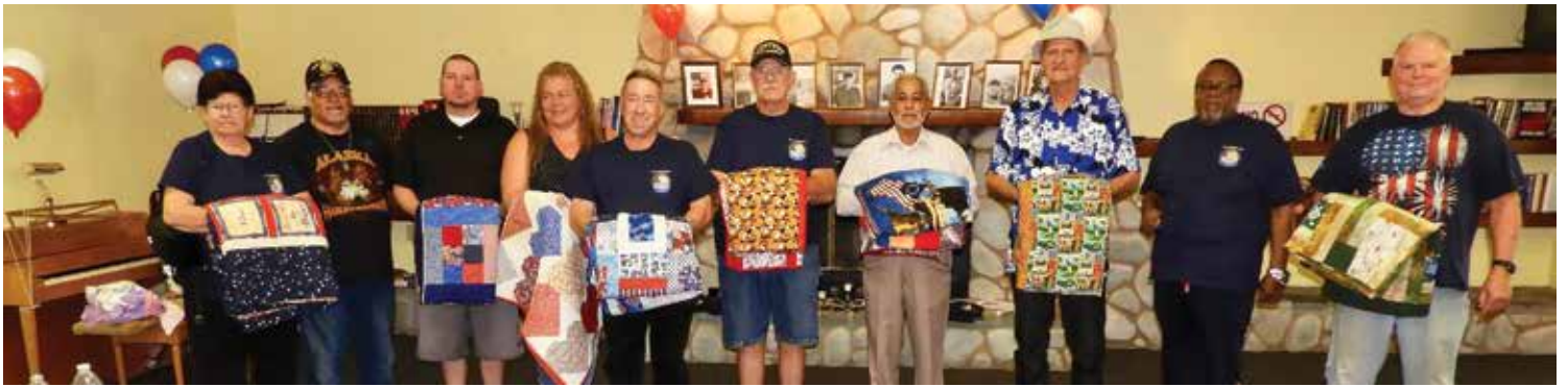
Quilt of Honor recipients gathered post meeting for a group photo.