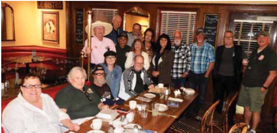
The AVAG team gathers for a photo at Mimi's Restaurant.

Because the AVAG team's monthly meetings in Sequoia Plaza Mobile Home Park in San Bernardino are early in the month, veterans and loved one held an early Thanksgiving/Veterans Day celebration with veterans from Sequoia, Santiago Hillside Estates, Santiago Parkside Estates and Glen Aire Mobile Estates a few days before the traditional Veterans Day date of November 11.