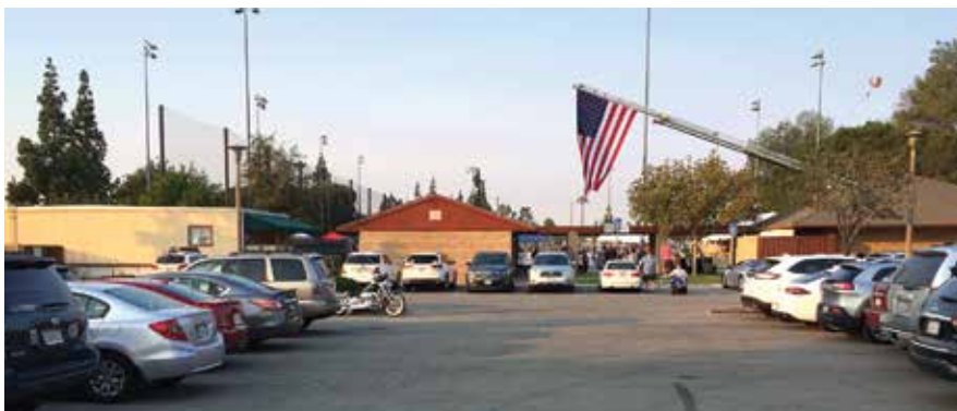
This is the entrance to Handy Park on Saturday November 10.