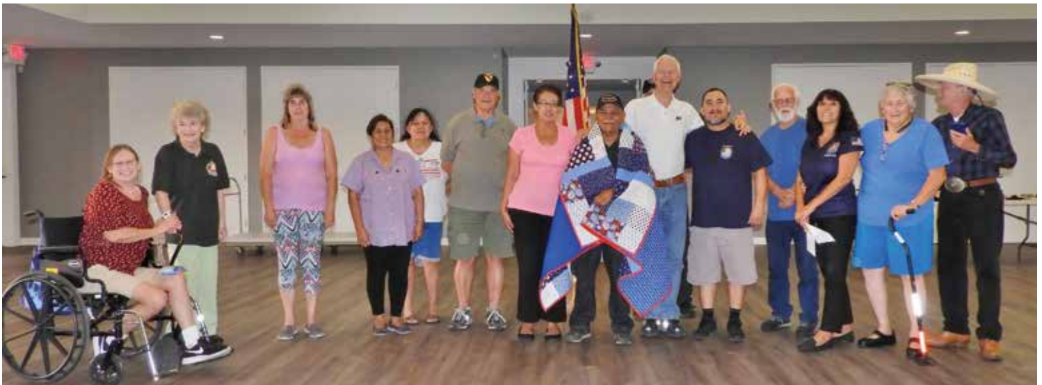
Sequoia veterans, family members, directors and neighbors join for the post-meeting photo.