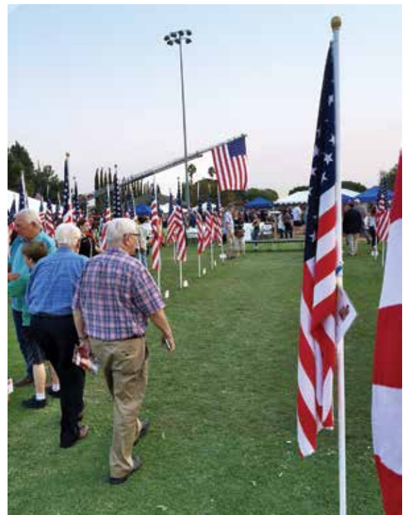
The view from inside Handy Park facing the park entrance. After the formal program, spectators, veterans and family members walk among the flags that have been donated to Orange Field of Valor event that covered seven days of activities at Handy Park in Orange.