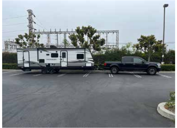
A donated RV trailer ready for delivery

cially Veterans that could use them?" I joke around with her all the time. I tell her she's the richest woman in the park, because it's not about the money, it's about all the compassion that she shows for her community. She started to share stories with me of different residents in the park, and and mentioned some in the park that could use an RV upgrade.