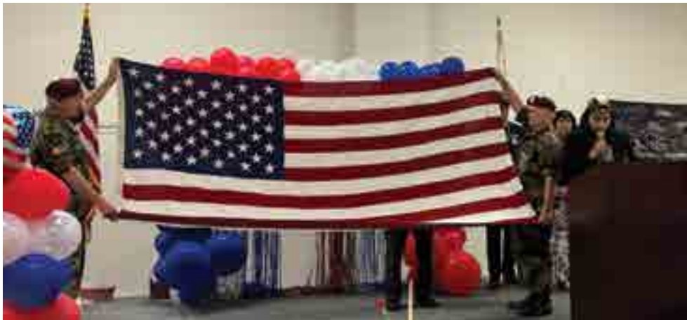
Members of the 82nd Airborne Association Lew Millett Memorial Medal of Honor Chapter lead dignitaries at the front of the parade kicking off the AVAG Memorial Day Luncheon.

Our communities mourn the loss of two of its members.