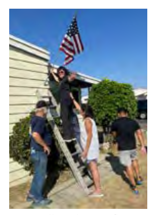
Installing the new flag.